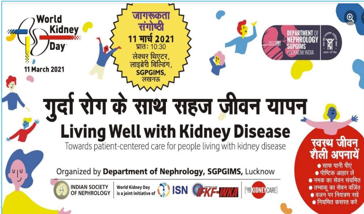
Community learning through awareness campaign of kidney diseases