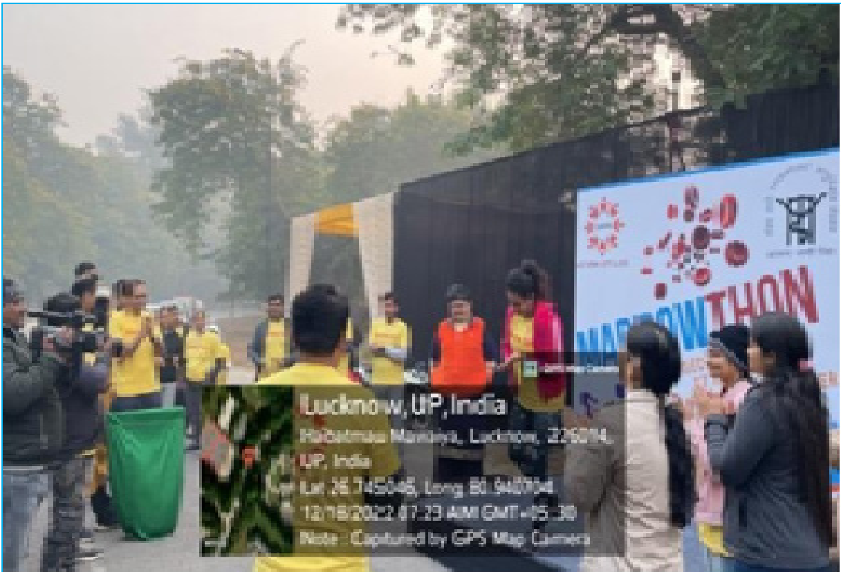
Community learning through Awareness -walkathon for bone marrow donation